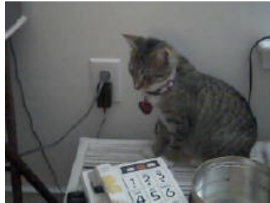
Just waiting for a call