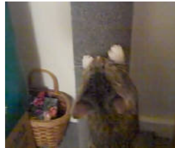
It's mine mine all mine!