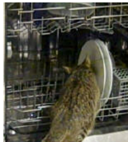
Boy he's really working at it.