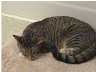
Just a snoozing