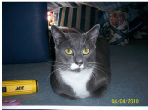
A nice hiding place