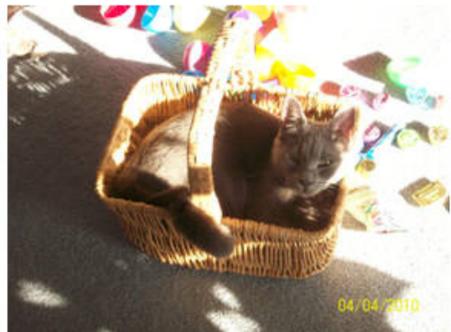
Don't I make a great Easter basket stuffer?