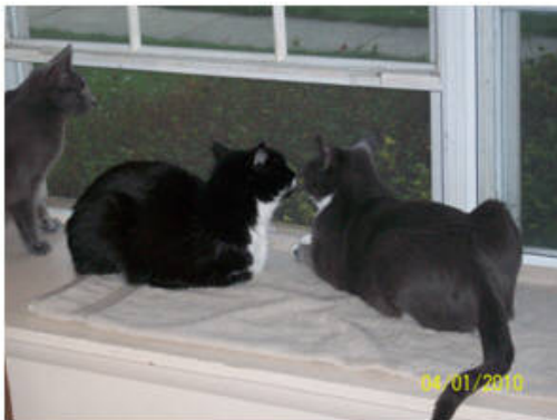
This window is perfect for lounging and enjoying the view