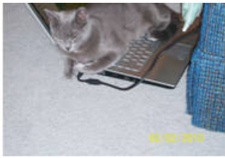
I swear I thought I saw a mouse!