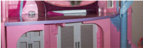
And Barbie's bed was juusstt right.