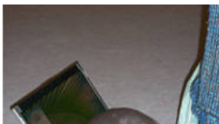
We'll send more pictures later on.