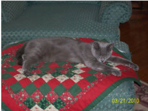
One of Bitsy's favorite activities...sleeping