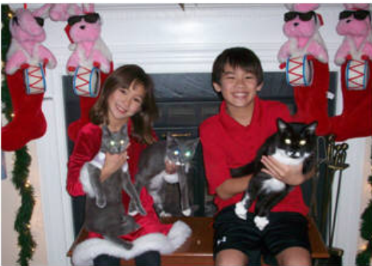
Our first Christmas