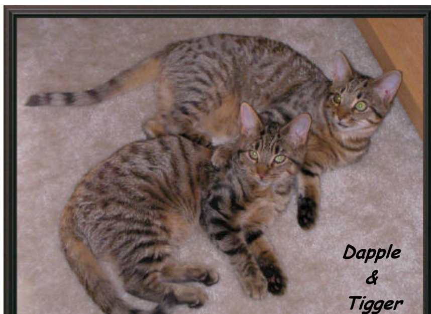
Dapple & Tigger